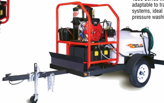
1270SS (shown with optional Portagear Kit)

1200 Series models are easily adaptable to trailer-mounted systems, ideal for mobile pressure washing